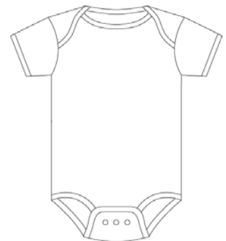
Sizes 6 months and 12 months

No expiration date. Questions? Contact Cari Ekbohm at (507) 288-5995 or dcekbom@gmail.com .