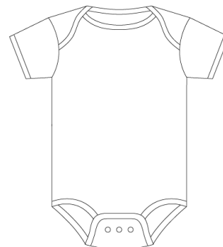
Sizes 6 months and 12 months

No expiration date. Questions? Contact Cari Ekbohm at (507) 288-5995 or dcekbohm@gmail.com.